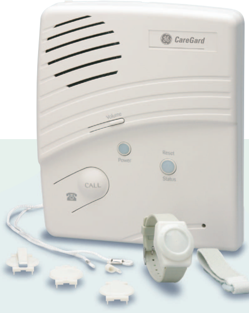
CareGard Contains: 1- CareGard Panel, 1- Personal Call Button and 1- User Manual

Rushing to answer the phone can be dangerous if you have health or mobility issues. CareGard lets you answer the phone from anywhere by simply pressing your Call Button. Talk immediately through the hands-free speakerphone, then take your time getting to the telephone.